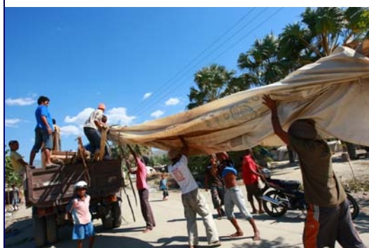
Movement out of Airport IDP Camp