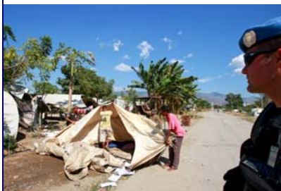
Movement out of Airport IDP Camp