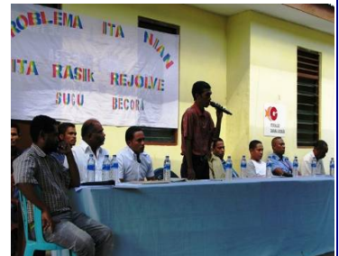
Top photo: The Sub-District Administrator of Cristo rei encouraging the Becora community to continue in the path of peace, unity and stability. Bottom photo: Simu Malu rites

Austcare’s work in Becora is a replication of its Neighborhood Corners approach which was piloted in the Beto community through most of last year. The current project is a one-year initiative which also covers, in addition to Becora, the communities of Aimutin and Delta. The Irish Aid and the Refugee International-Japan (RIJ) are funding Austcare’s activities in these communities.