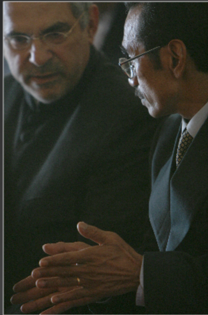
H.E Dr Jose Ramos-Horta talks to Francisco "Lu-Olo" Guterres , the Speaker at the National Parliament