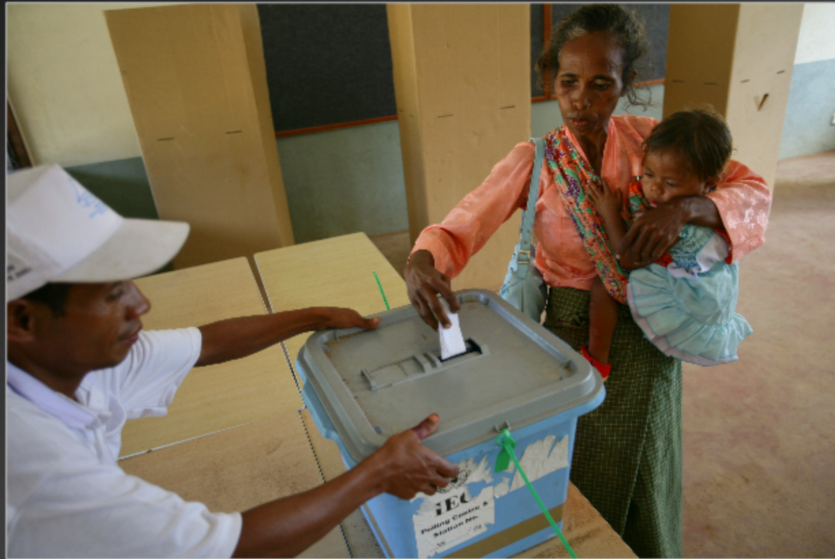
A woman votes in Quelicai