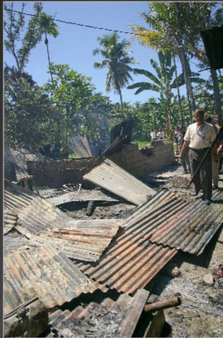
SRSG, Atul Khare, walks through the burnt houses in Bairro Pite