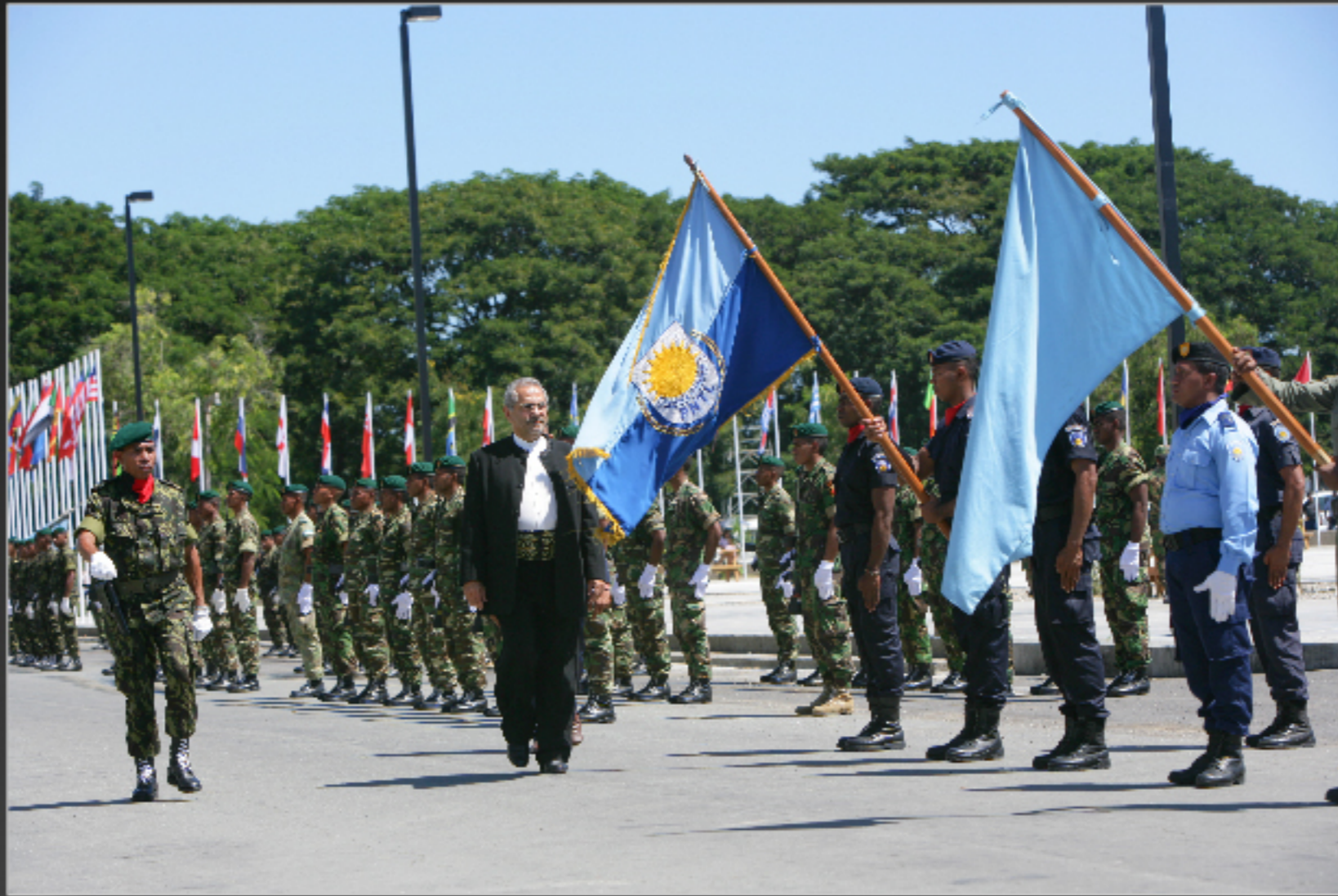
Newly elected President, Jose Ramos-Horta, inspects the Guard of Honor in front of the Dili Government Palace