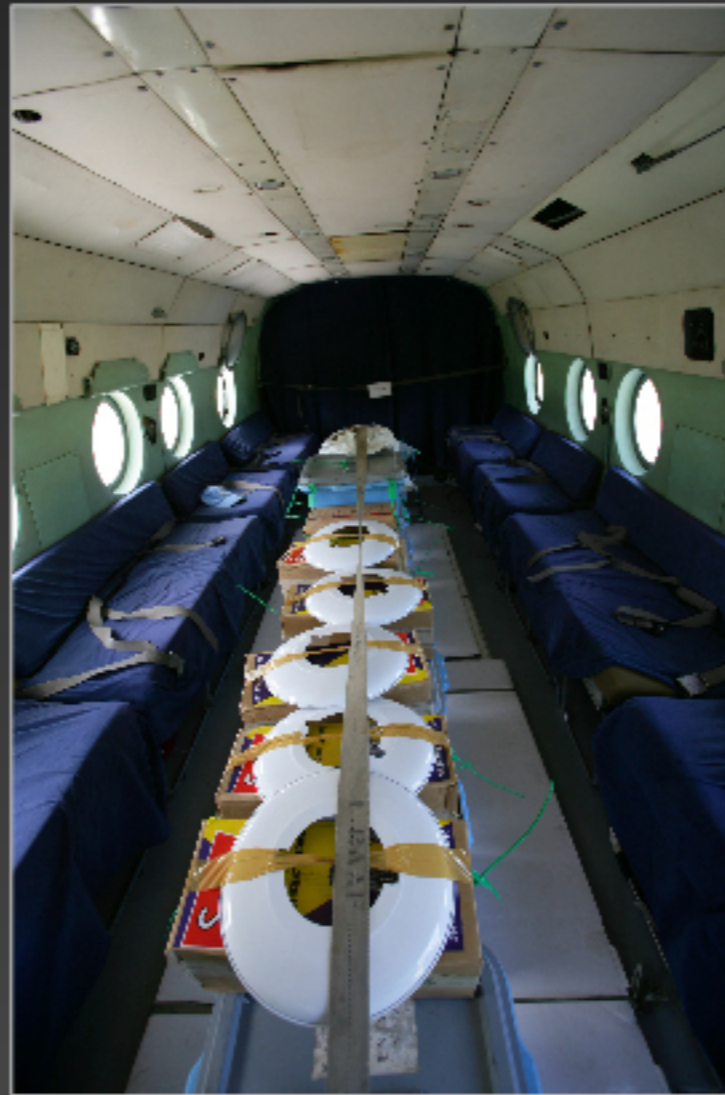
Dropping off non- sensitive electoral materials in remote Timor-Leste communities with UN helicopter. 8 May 2007