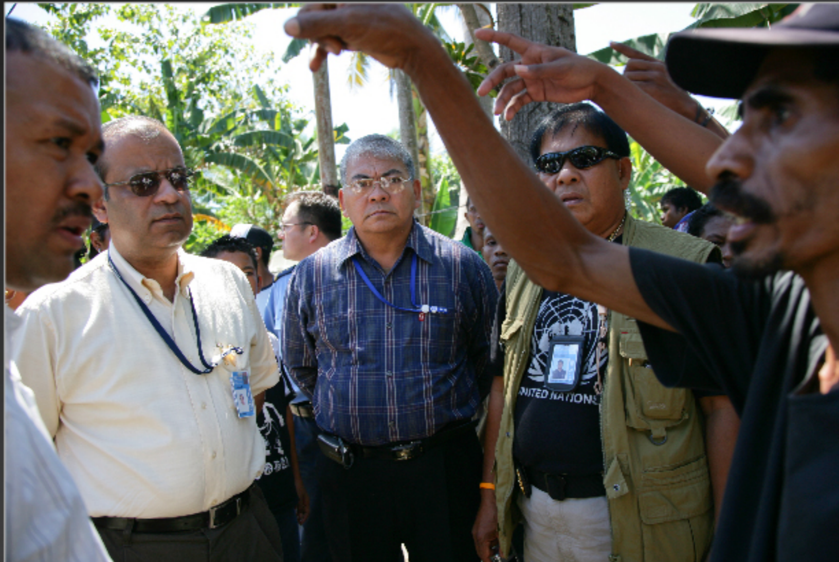
SRSG visits Bairro Pite, in Dili, where arson and rock-throwing occurred 15 may 07 between two groups