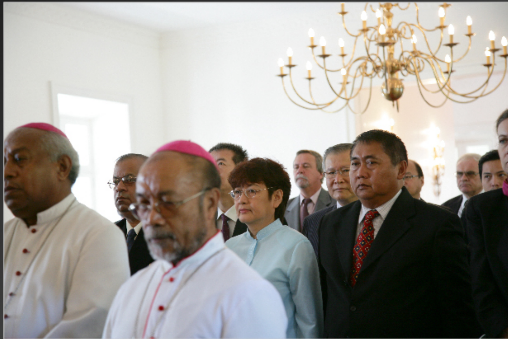
SRSG and DSRSGs during the inauguration's Ceremony of the 3rd Constitutional government. 19 May 2007