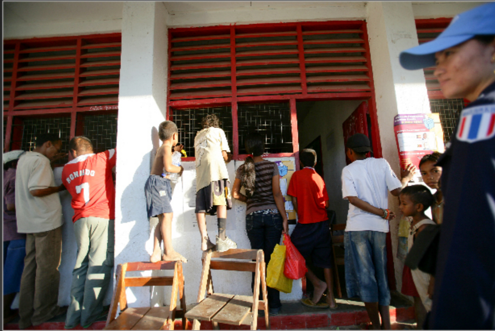
UN police officer from Thailand for security during vote counting