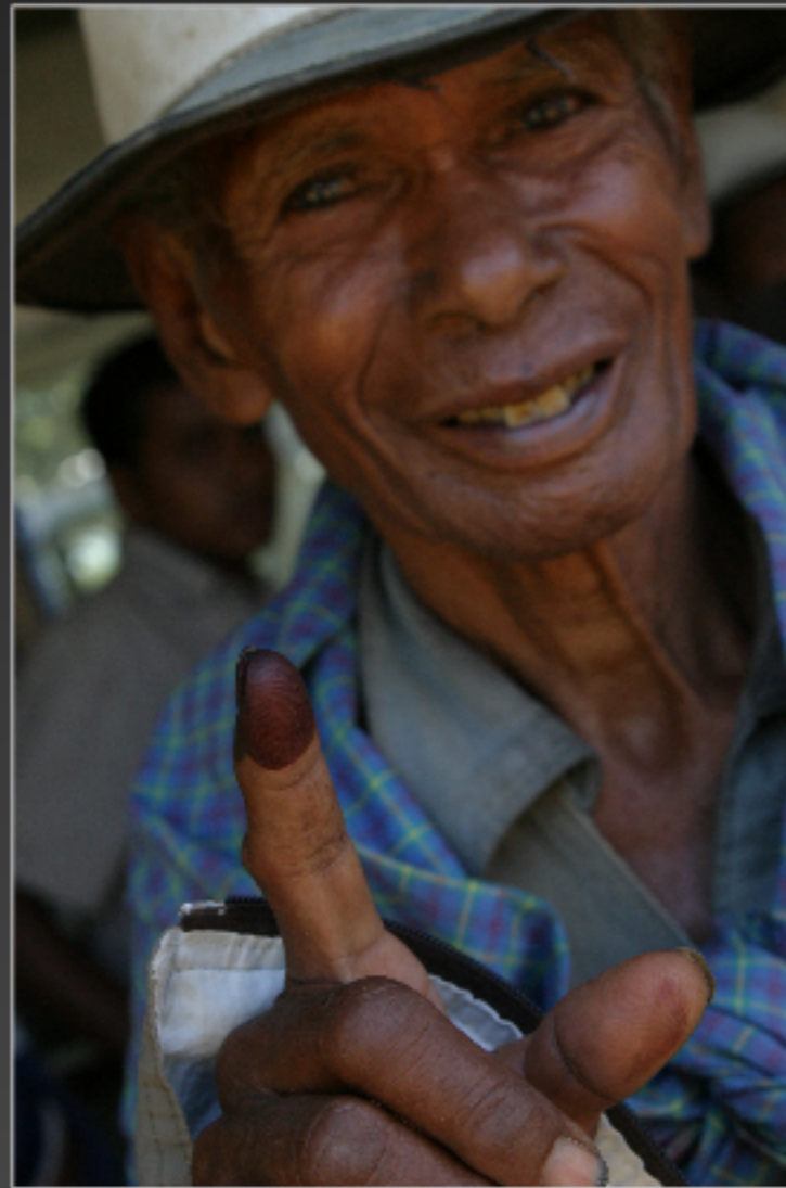
A Quelicai resident shows the ink on his finger after the vote