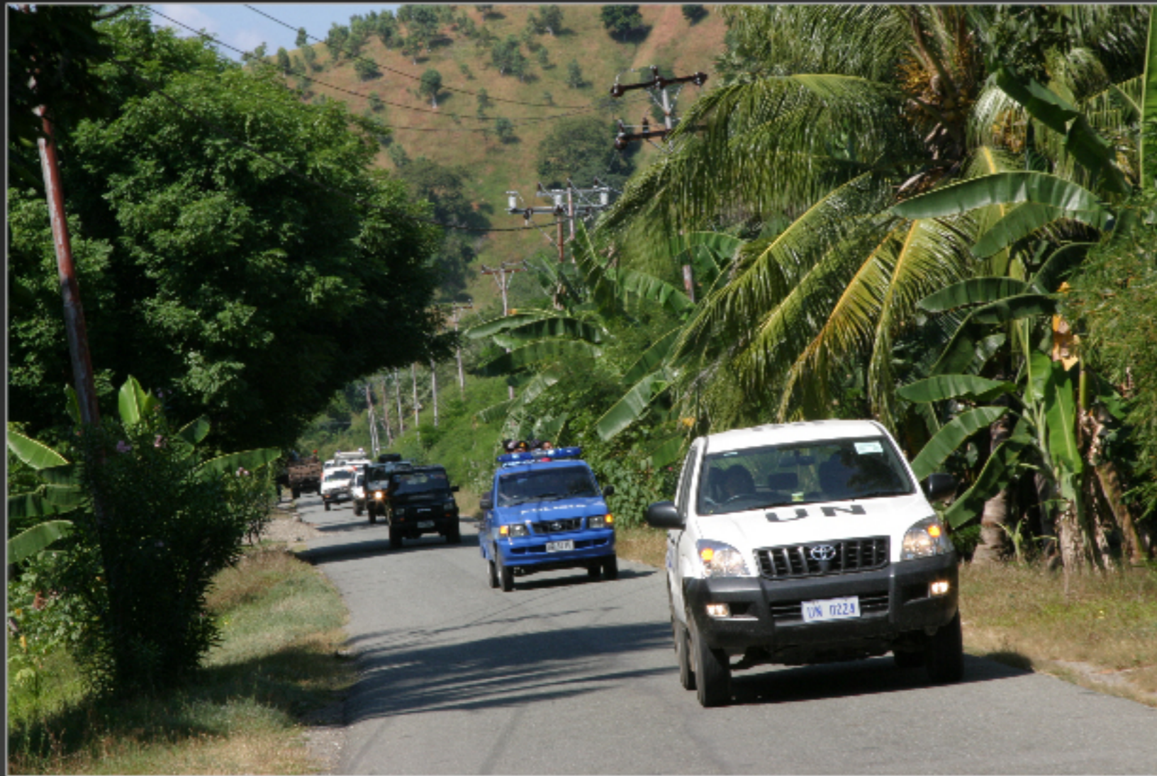
UNPOL and GNR ( Portuguese mobile brigade) escort ballot boxes brought from Baucau for the final tabulation