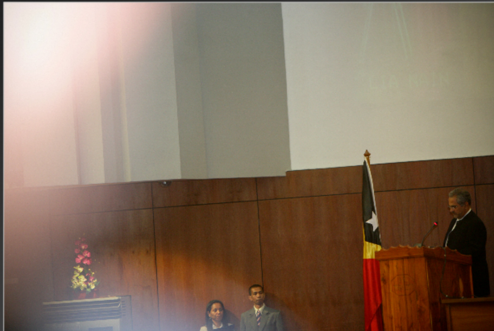
The newly elected President of the Democratic Republic of Timor-Leste Jose Ramos-Horta makes a speech