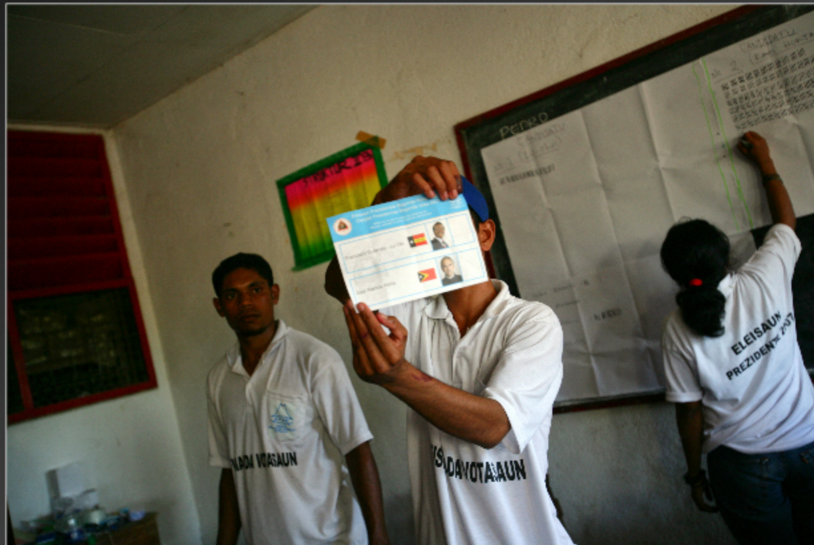
Vote counting in a Dili polling station