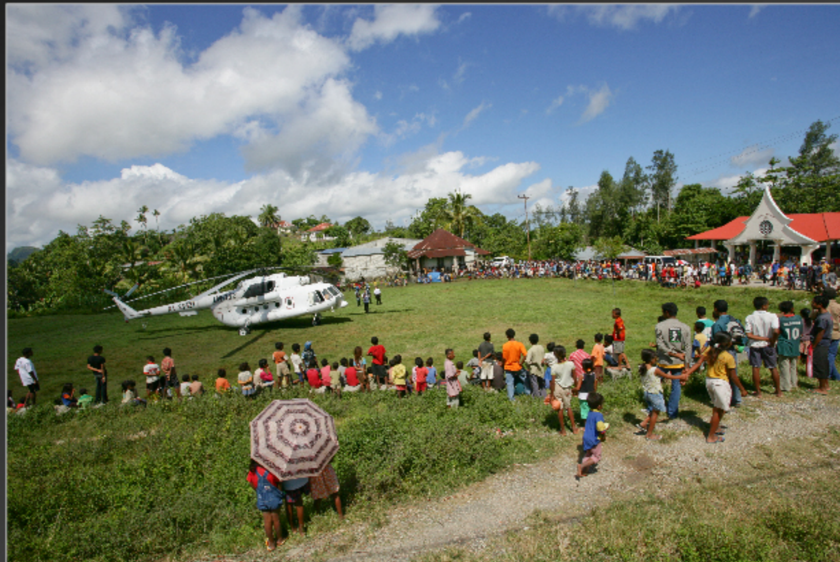
UN Helicopter carries SRSG's team and media to Ossu