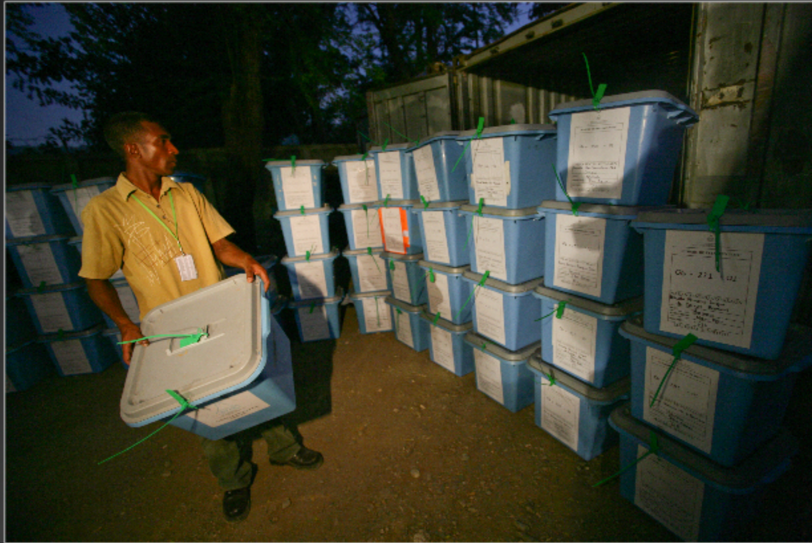
Ballot boxes brought to the national electoral body at night time from all districts