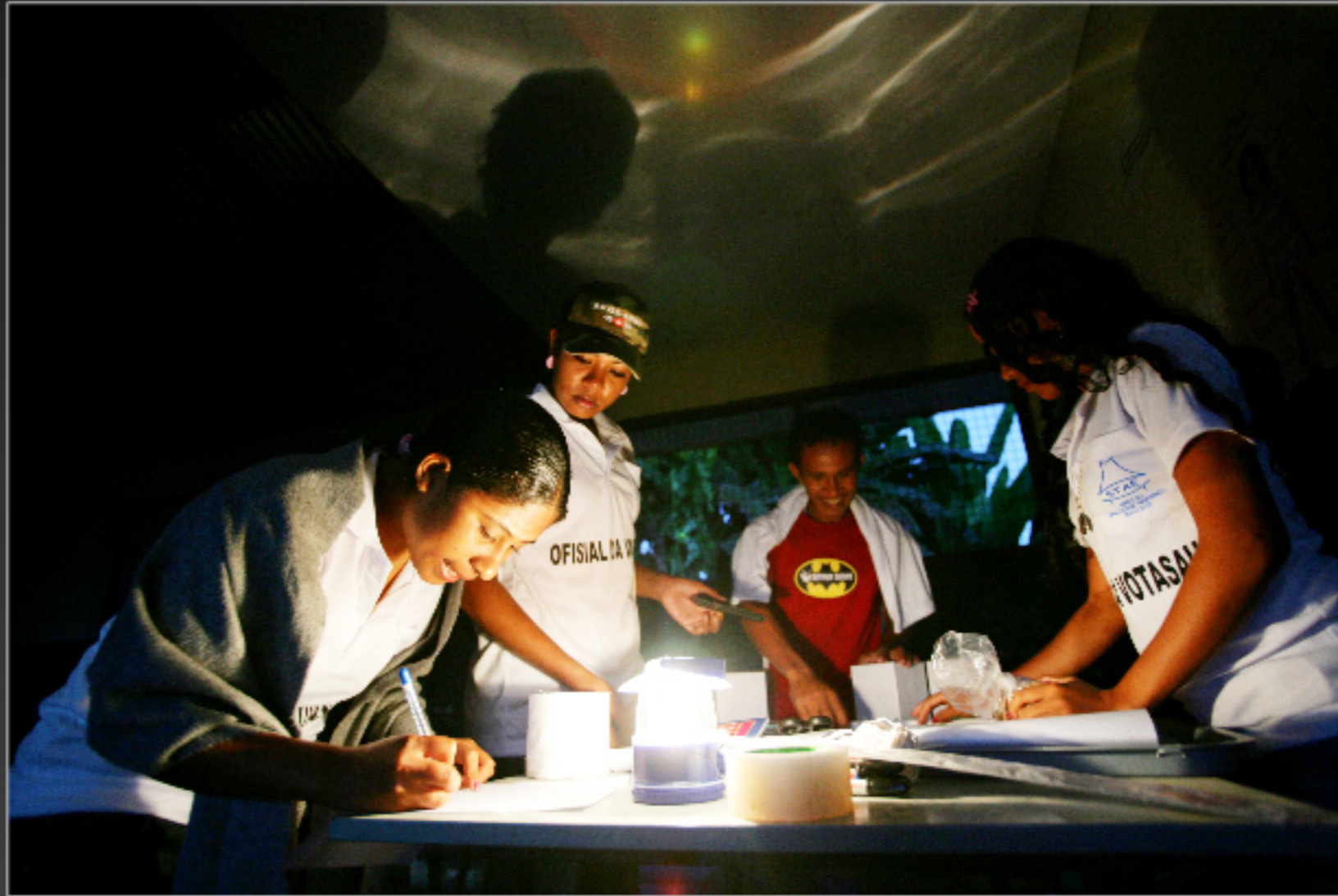
6 am preparation for the opening of the voting station during run-off Presidential elections in Timor-Leste 9 May 2007