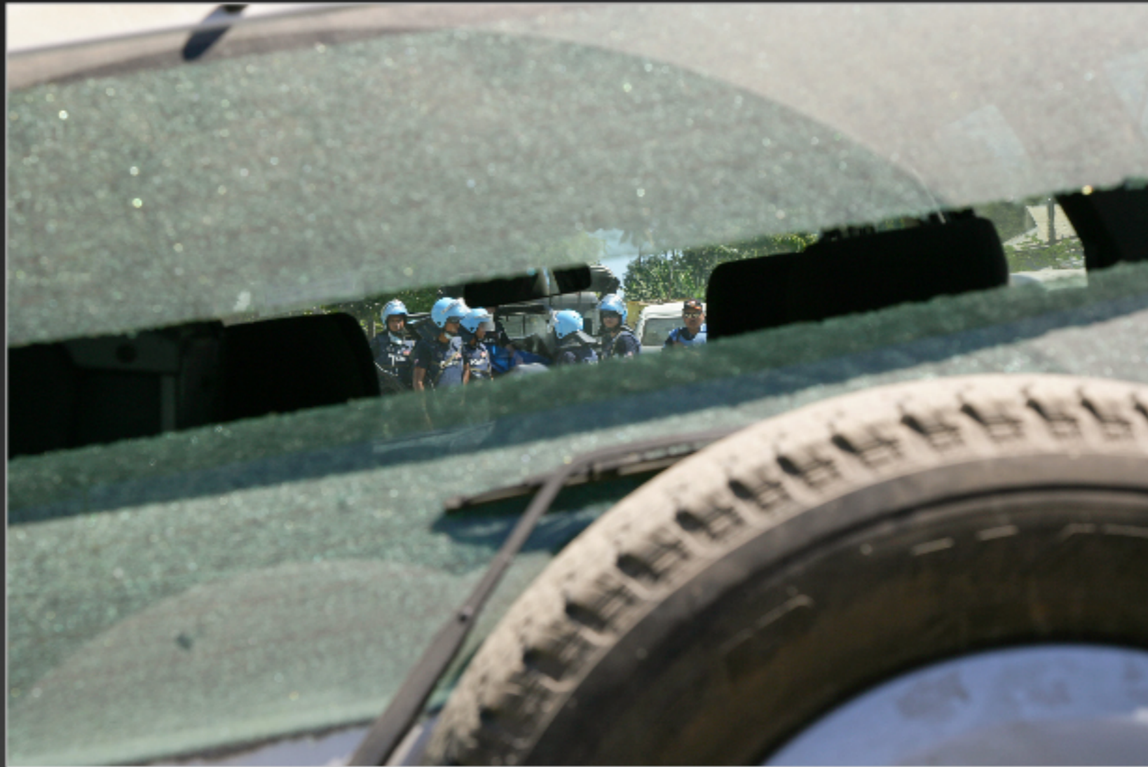
Broken window in one of the UNPOL vehicle