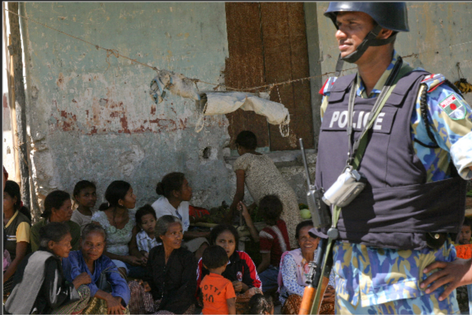
A Bangladeshi FPU ensures security in Ossu during the run-off Presidential elections in Timor-Leste