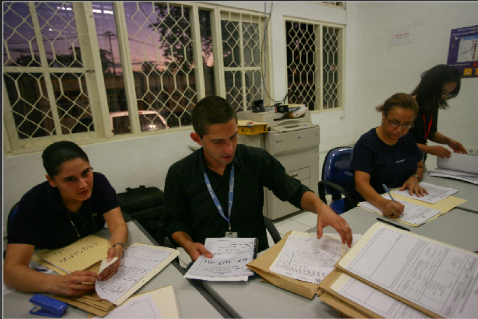
UN staff working at the national electoral body