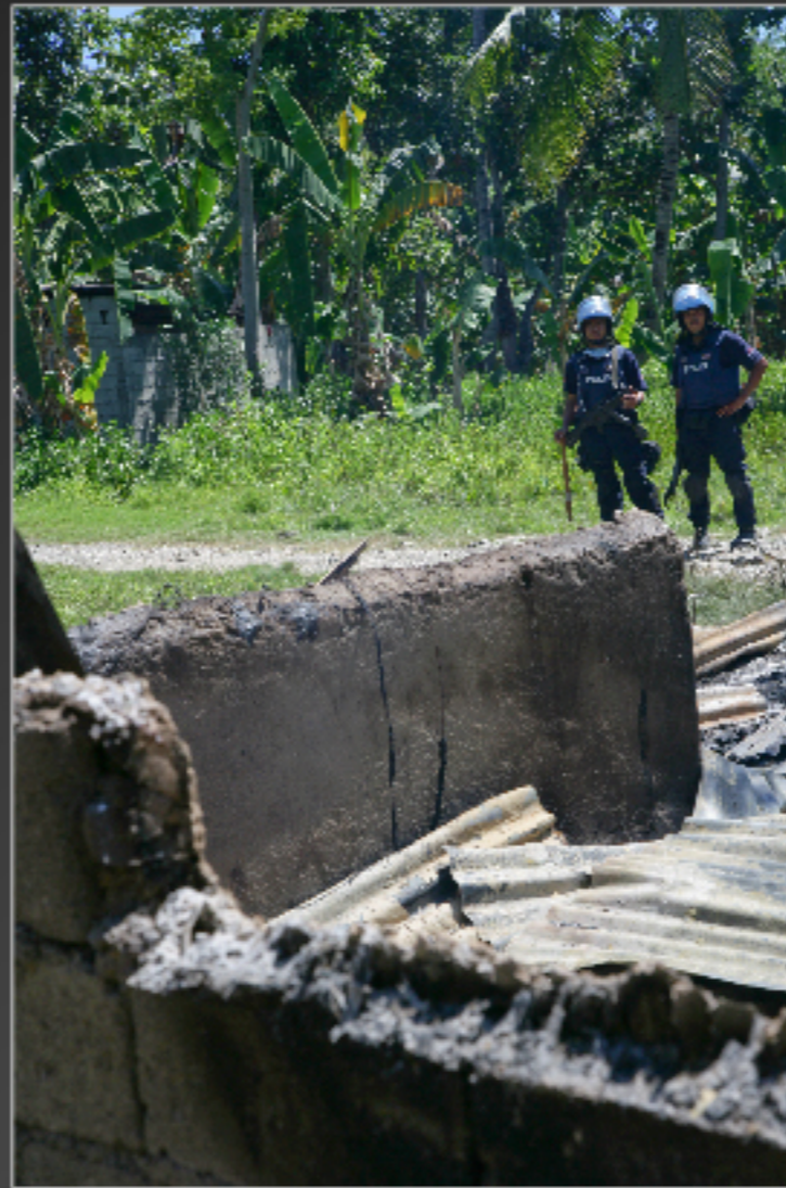
Malysian FPU on the scene of burnt houses