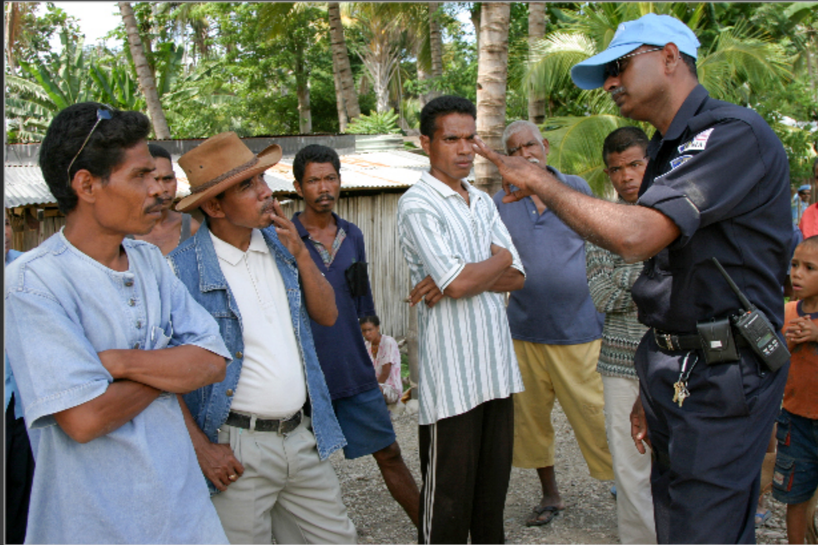
A UN police officer talks to local residents about security situation in Makadiki