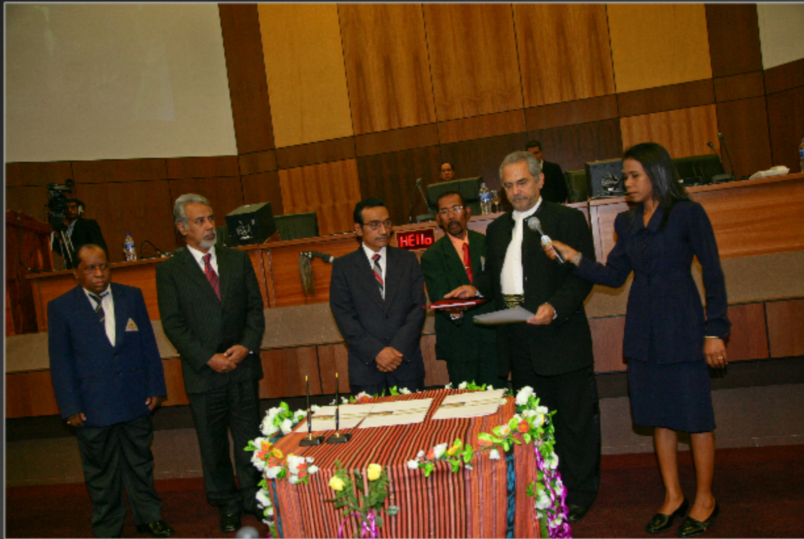
H.E Dr Jose-Ramos Horta during the swearing-in ceremony as newly elected president to the Democratic Republic of Timor-Leste