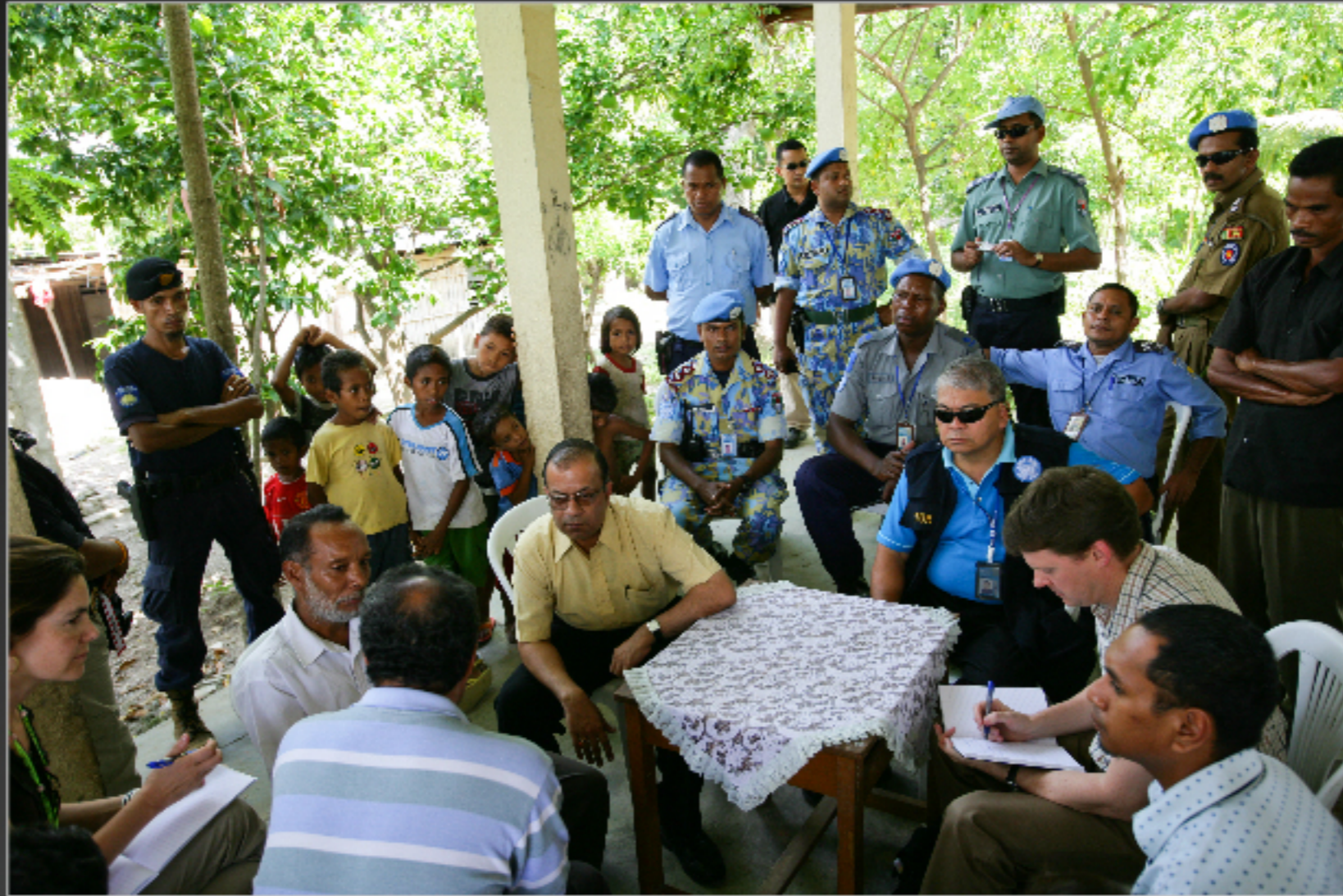
SRSG's team meets with local authorities in Uatulari