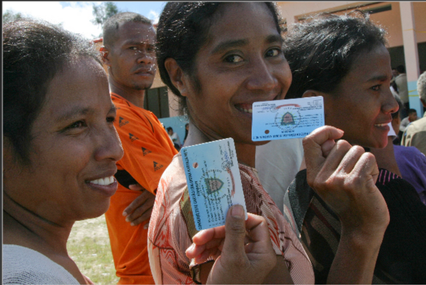
Women show their voter cards during run-off Presidential elections in Timor-Leste