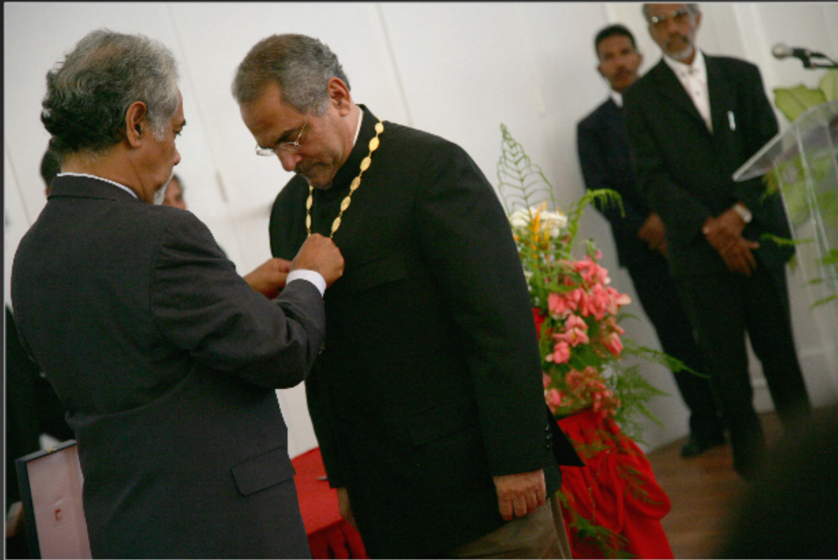
President Xanana Gusmao decorates H.E Dr Jose Ramos-Horta during a Ceremony of Homage