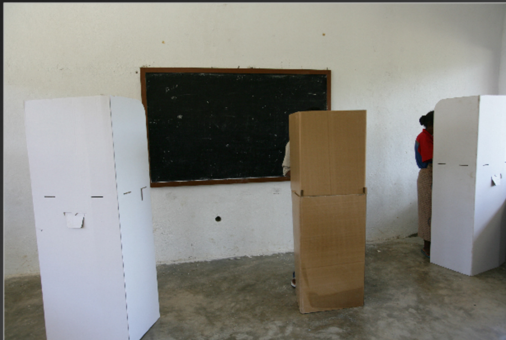
Voters behind the voting booths