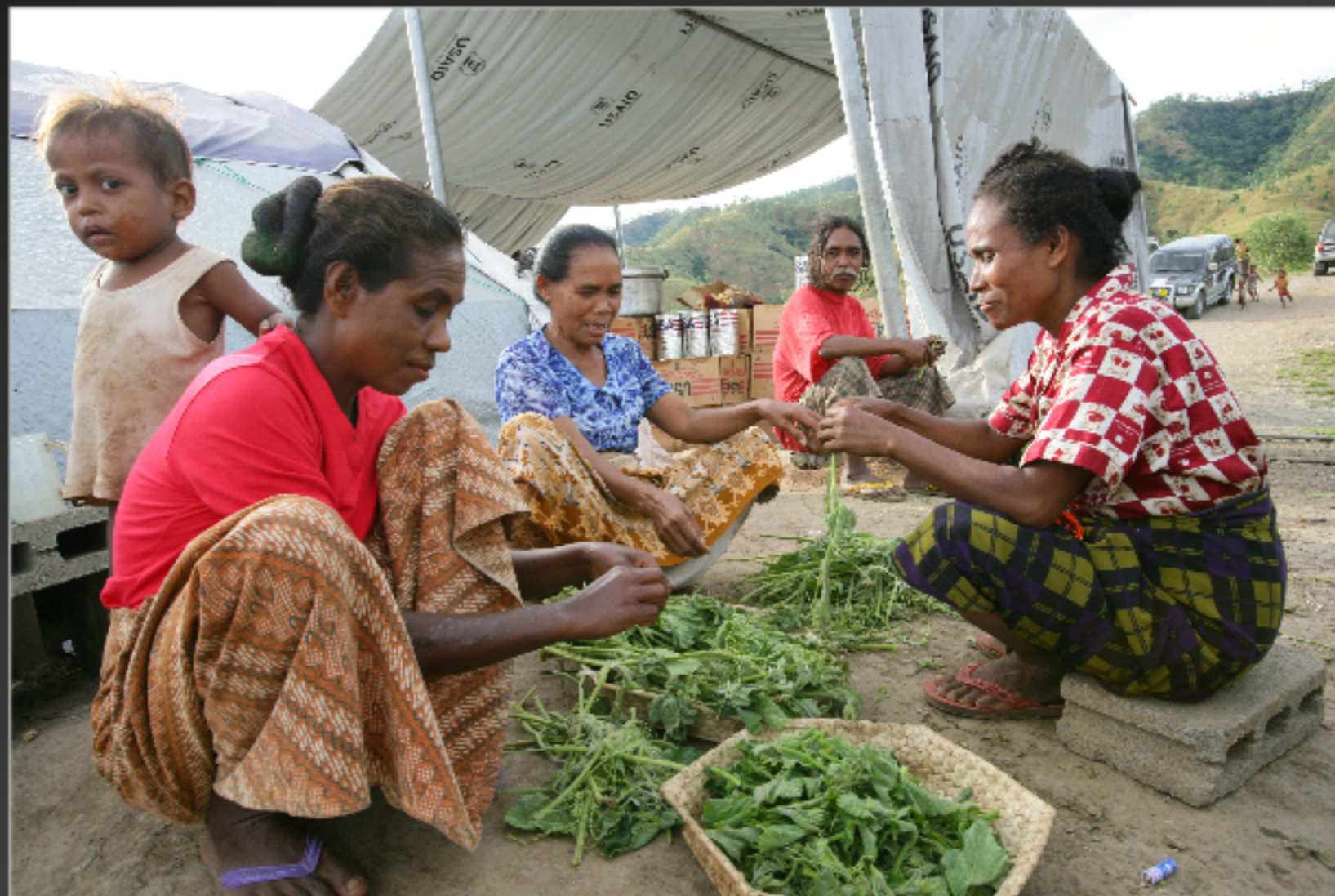
IDP's in their daily lives in Metinaro