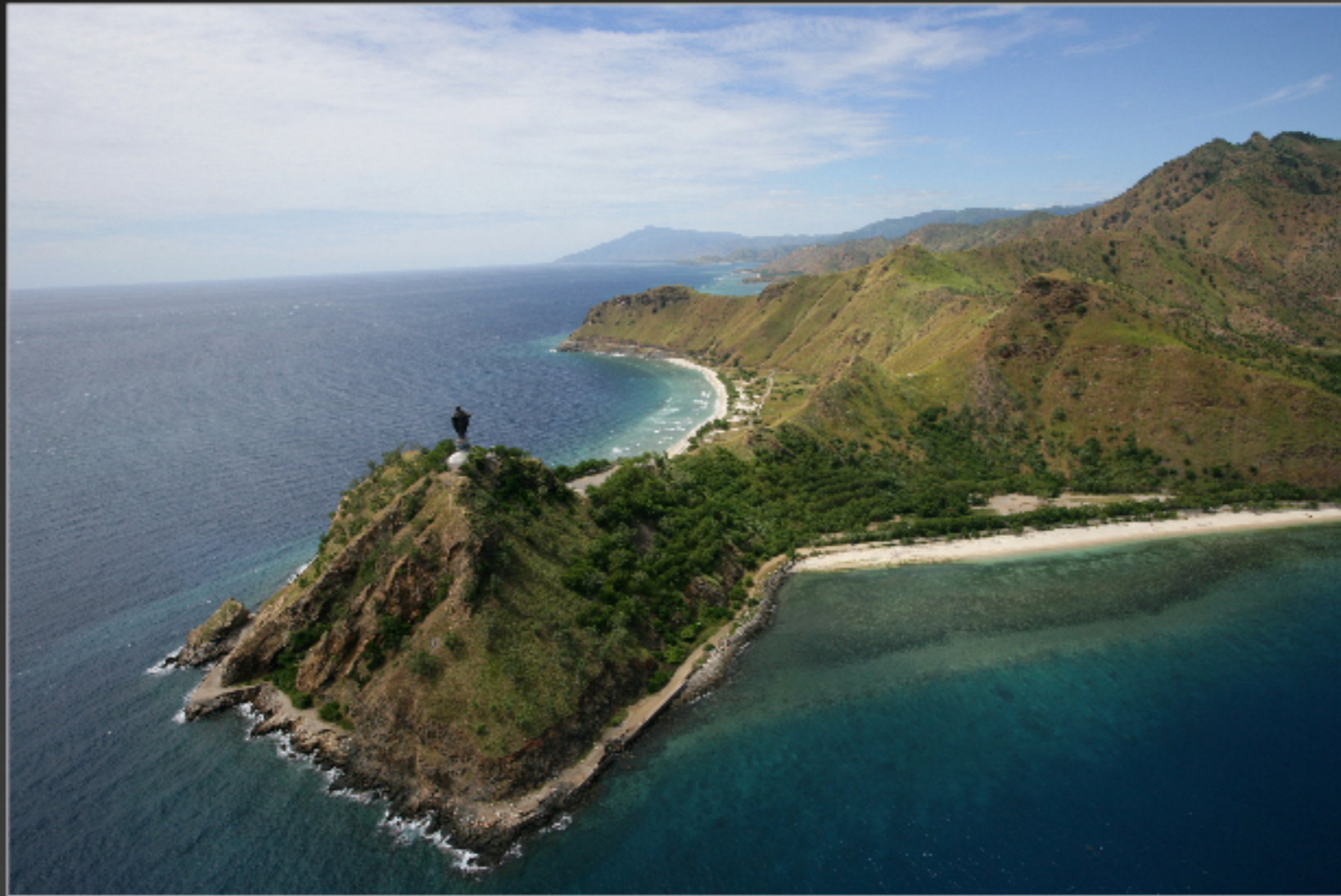
The road to elections: UN support to Timor-Leste for the presidential poll