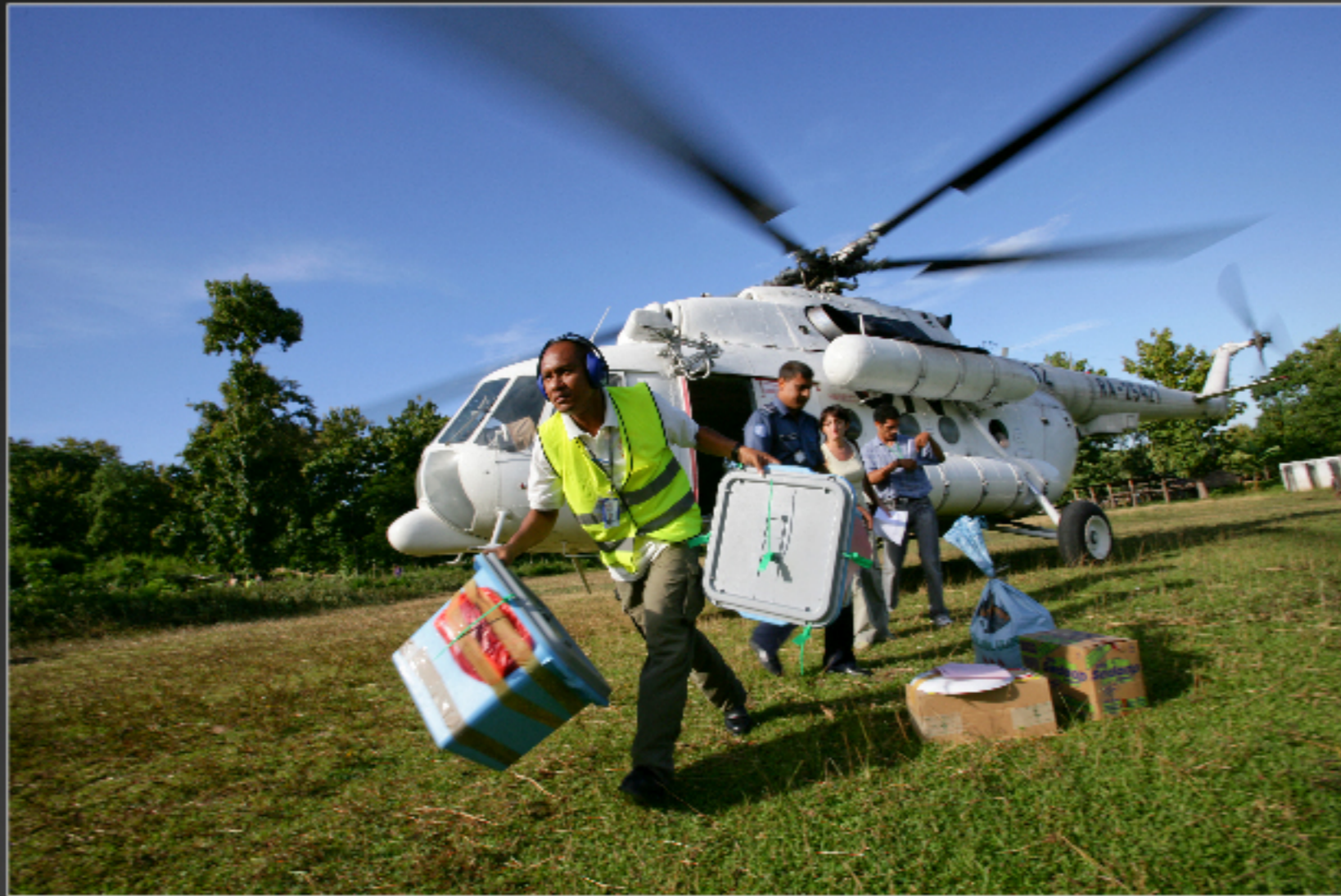
MOVCON officer helps carrying the ballot boxes out of the helicopter in Same