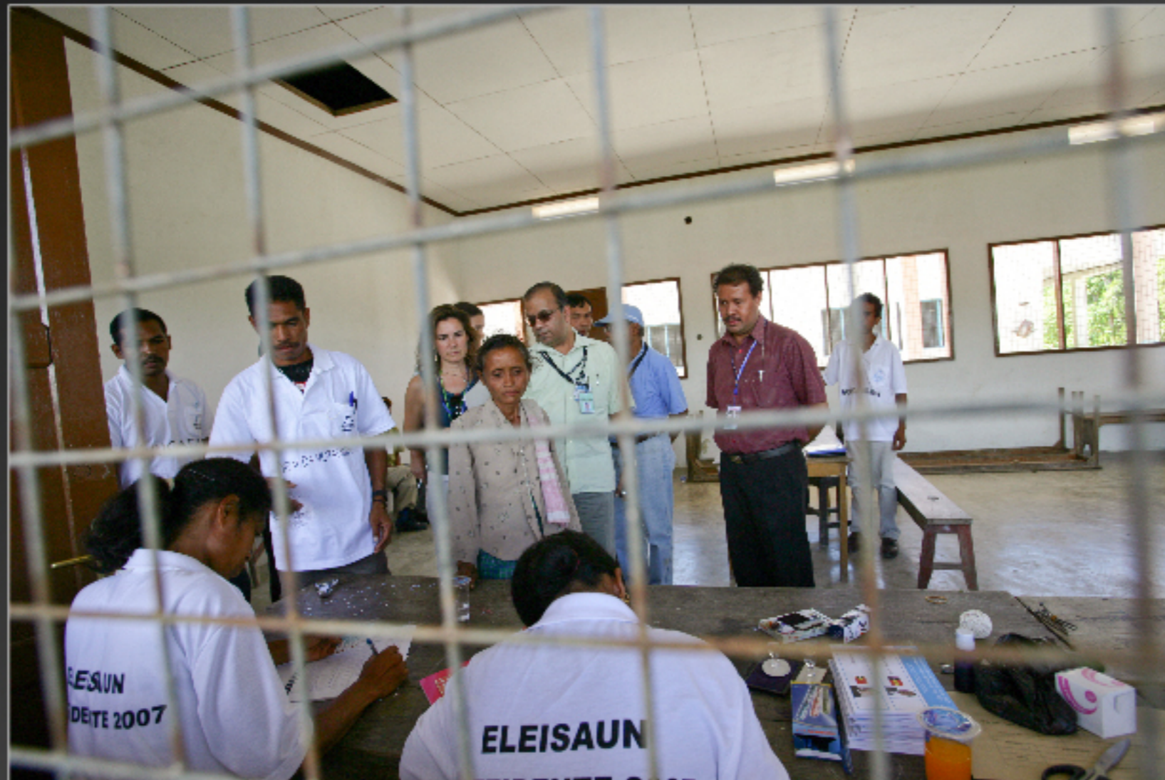
SRSG and his team visit one polling station in Ossu