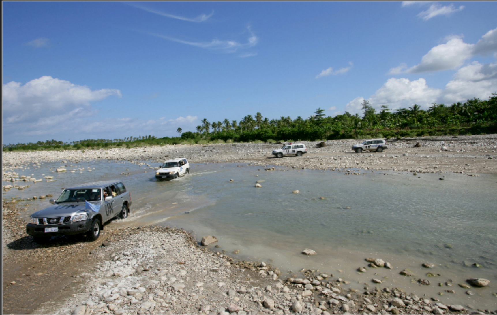
SRSG's team drives from Afolokai to Babulu