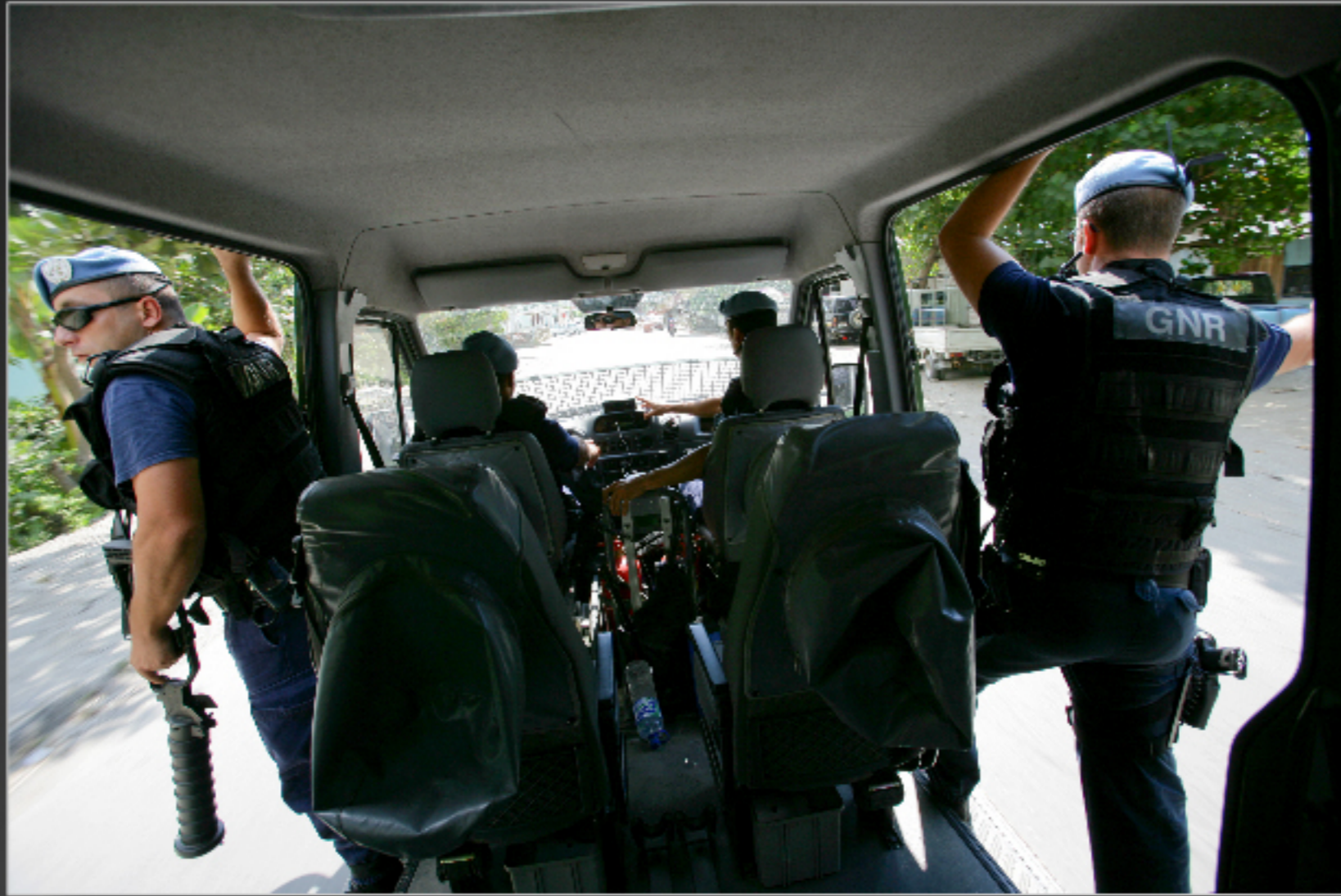
GNR escort ballot boxes