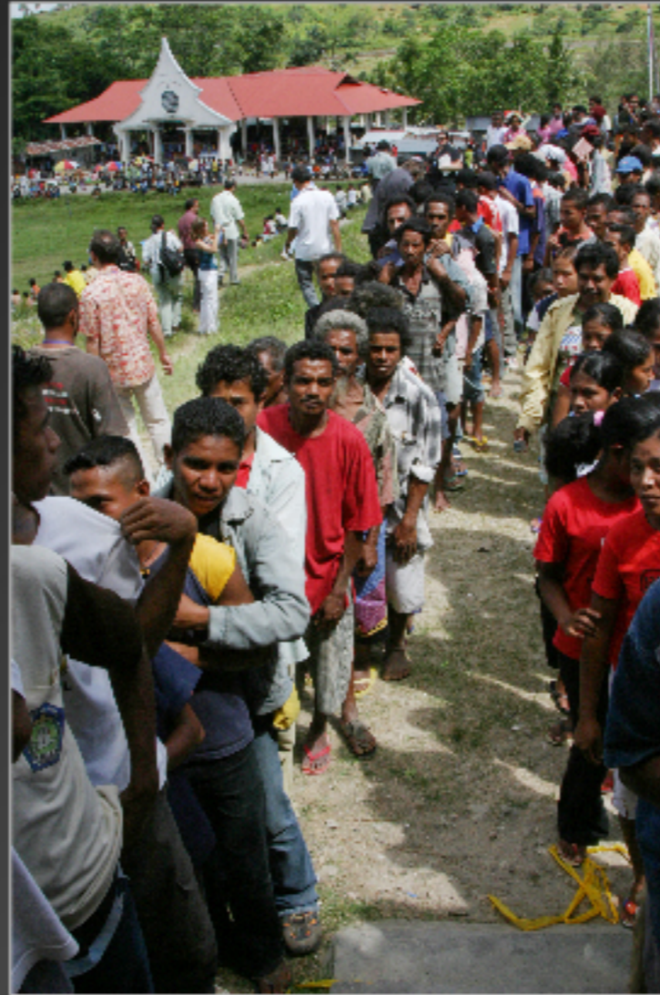
Local residents in Ossu line up at polling station