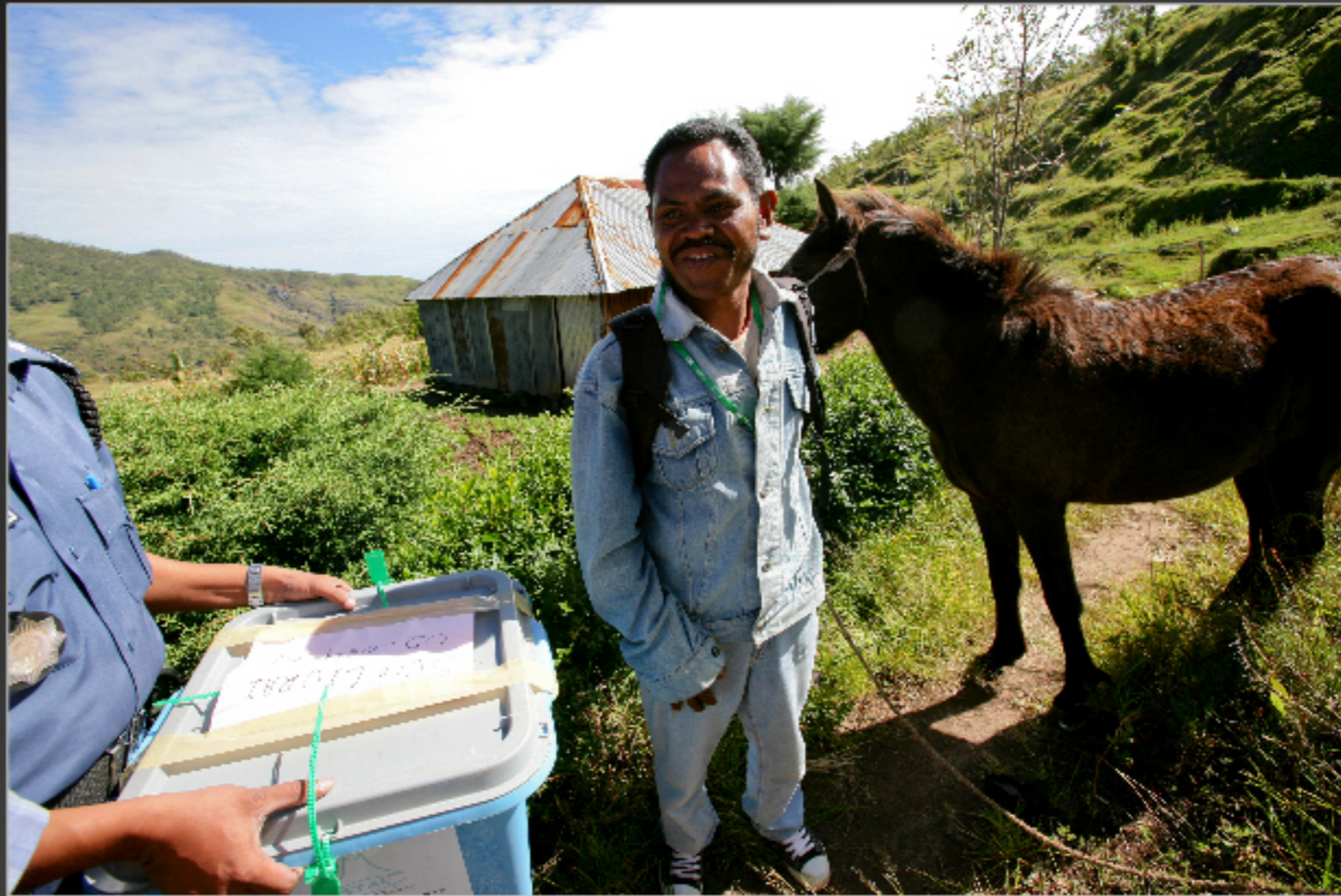
A UN police officer carries a ballot box to an electoral officer. The officer reaches remote communities by horse